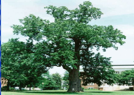
The Liberty Tree, St. John's Campus Annapolis, Md.

To all Members of Save-A-Patriot Fellowship: