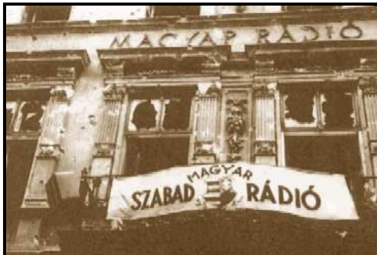
Free Hungary Radio, circa 1956.

I thank the Lord that as I write this article, our free speech, political or otherwise, remains mostly intact. However, this is not the result of the generosity or good will of those who tirelessly labor to make our great